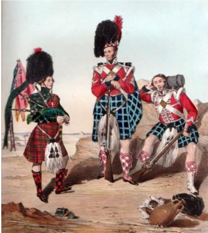
Plate 3. 42 nd Piper wearing the Music tartan c1836. Cannon, Historical record of the Forty Second.