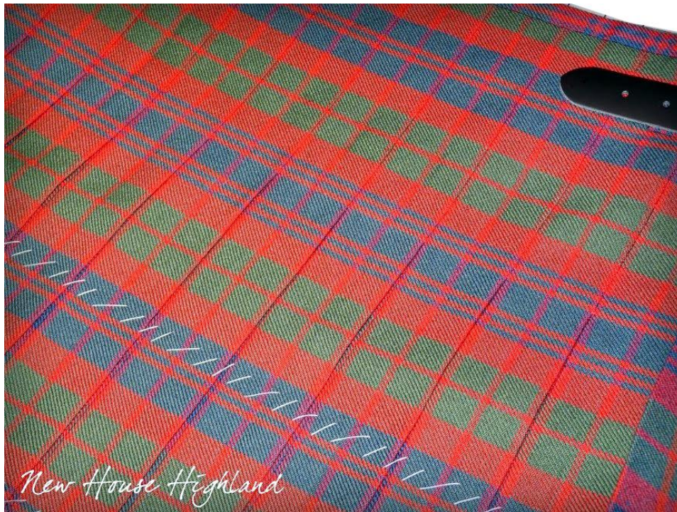
Plate 11. Rear view of a modern box-pleated kilt in the Band tartan.

Once the regimental bands stopped using the red Band tartan it seems to have fallen completely out of production, a fact reinforced because, unlike other military tartans, it had not been adopted for civilian use outside the Army. The tartan remained largely unknown until scholars began to examine Wilson's records in the late 20 th century since when there has been a revival of interest (Plate 11).