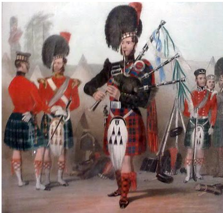
Plate 4. 42 nd Piper wearing the Music tartan c1854.