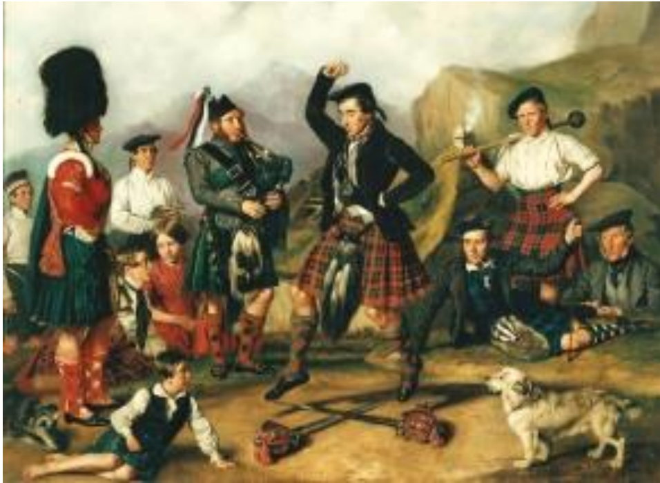
Plate 9. The Sword Dance by David Cunliffe c1853. The dancer wears the Band tartan.