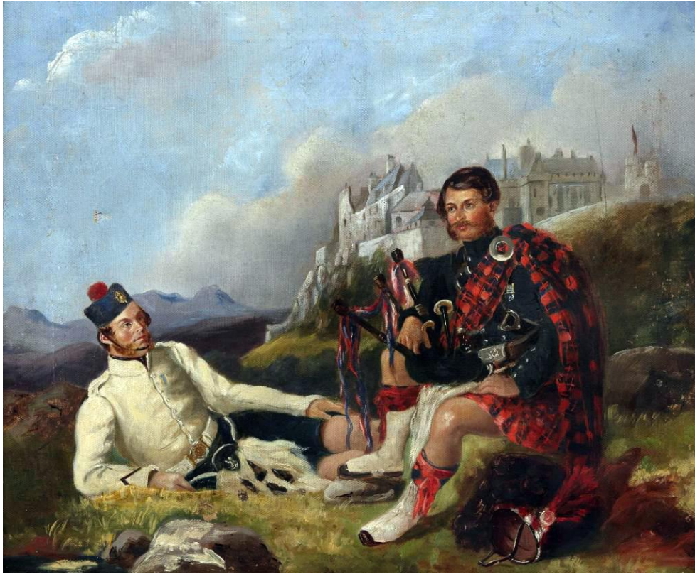
Plate 5. Private and Piper, 42nd Regiment of Foot, Unknown artist c1858.

Shortly after the 1858 portrait regimental bands became part of the official establishment and, in the case of the 42 nd , the Band adopted the standard Government tartan which they wore until disbanded in the 1990s (Plate 6).