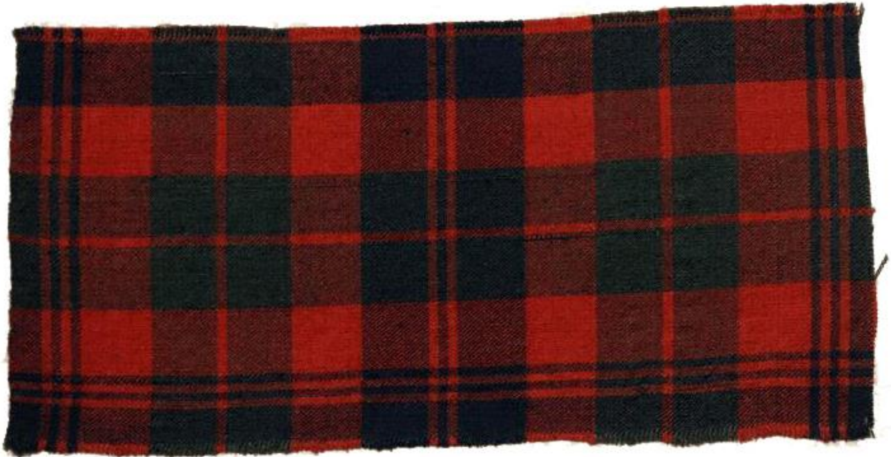
Plate 2. Specimen of Wilson's 42 nd Band tartan c1820.

Wilson's details for the Sergeants' plaids show that the Band tartan was woven 26 inches wide with '.....3 half Setts and so much of the 4th until all the green in it is put on after which conclude with the red selvedge mark'. The selvedge mark was approximately two inches and was a feature of early military tartan used for plaiding. The only known surviving specimen of Wilson's cloth shows a portion (2 half setts) of this setting (Plate 2).