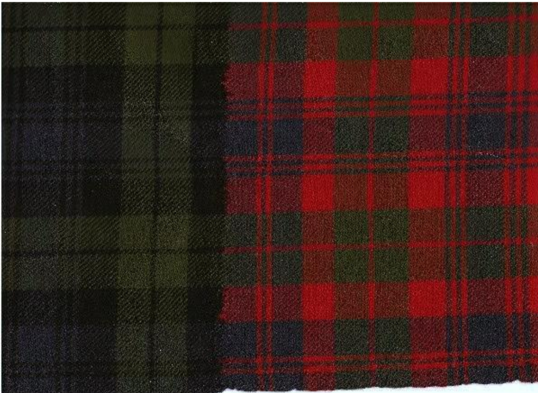
Plate 1. The 42 nd or Government tartan and colour change to form the Band or Music tartan.

The effect of replacing the black of the Government tartan (commonly called the Black Watch) to make this 'red' sett is shown below (Plate 1). The resulting blue, green and red tartan is striking and makes the blue appear dominant compared with the standard 42 nd setting.