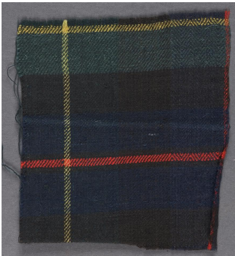
Fig 3. Sample of cloth for Sergt s Plaids sent to Lord Loudoun Aug 1746.

So, from the quote and the sample 4 we know that in 1746 Loudoun was about to purchase new plaids for the soldiers of the Regiment in a dark blue, green and black tartan (Fig 3). The fact that there is no mention in the letter of it being a new patren (pattern) suggests that these were replacement plaids for the initial issue ones in early 1745. The quote also shows that the Sergt s and Private wore a different quality of cloth. Although they would have had to comply with the overall uniform, Officers purchased their own clothes which is why they are not quoted for.