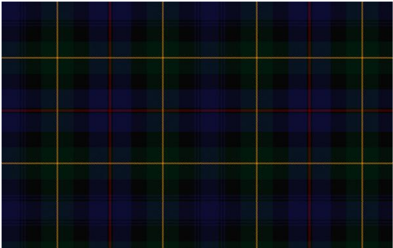
Fig 5. An alternative reconstruction of Loudoun's Highlanders tartan (PEM 2010).

There is a great deal of debate about when the Government or Black Watch tartan was first adopted. The Regiment pre-dated Loudoun's and from portraits we know that the tartan was in use by c1760 at the latest so it's entirely possible that the full setting of the 64 th 's tartan was a decorated version of the Black Watch. If that were the case the result would be the tartan below (Fig 5) which is almost identical to that used by the later Baillie Fencibles raised in 1794.