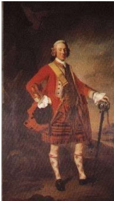
Fig 1. John Campbell, 4th Earl of Loudoun c1747

In 1747 Lord Loudoun was painted in what he referred to as his regimentals . The portrait shows a typical mid-18 th century Highland gentleman. His clothes include a red military type jacket, a predominately red belted plaid and diced hose. The tartan has been identified as what is now known as Murray of Tullibardine 2 .