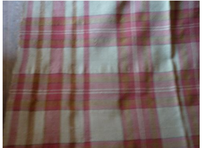
Fig 1. One side of the plaid showing the sett and barred border.

It's possible that the Blair plaid was damaged at some time as it has been cut up and sewn into a different shape with a fringe added, most probably during the Victorian era, but it's still possible to determine the detail of the original which was made from an length off-set cloth 21 1 / 2 " wide that was joined and finished with turned ends. Fig 1 shows the simple arisaid type sett together with the decorated barred selvedge. It's impossible to establish how long the plaid was as it has been cut in half widthways and one of the pieces then added to the remaining joined section to make a piece roughly 65" square. Material from the excess piece was then used to patch some holes and tears in the square and a fringe was added to one side. Fig 2 shows the detail of the barring and turned end.