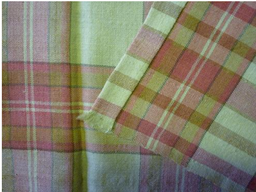
Fig 2. Detail of barred selvedge and turned end.