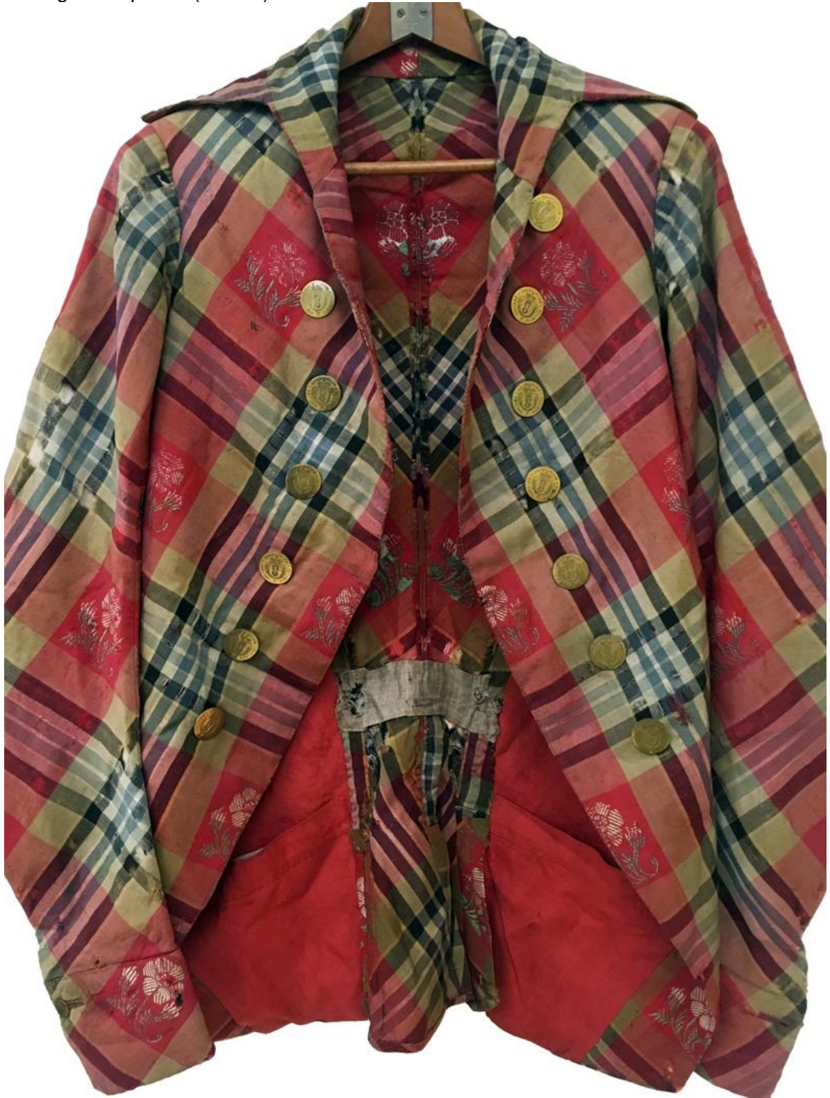
Plate 4. Interior showing the partial lining and two tail pockets.

Externally, the tartan is biased cut and beautifully matched, especially on the back and sleeves. Internally, the coat is partially lined with red woollen twill material and includes two internal tail pockets. Elsewhere, the rough seams are visible, not an uncommon practice in clothing of the period (Plate 4).