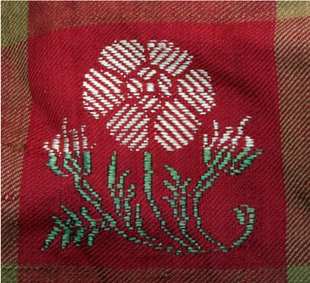
Plate 7. Woven silk motif representing James VIII/III and Princes Charles and Henry.

The worsted wool cloth is narrow, 15-17 inches wide, which is uncharacteristic of traditional 18 th century tartan intended for plaids, kilts and other clothing. This piece is unique amongst examples of 18 th century tartan in having a decorative weft-faced silk motif (brocade) woven into it. On each of the red squares there is a white rose and two buds representing the Old Pretender, titular King James VIII/III, and his two sons, Princes Charles and Henry (Plate 7). The use of such obvious Jacobite iconography only 33 years after the last execution of a Jacobite leader 3 is extraordinary and shows just how safe it had become to make such references without fear of reprisal.