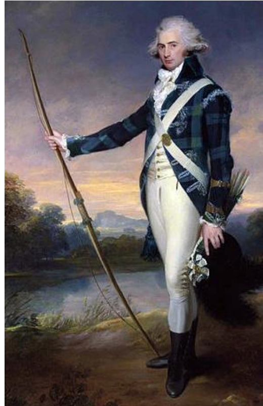
Plate 5. George Douglas, 16th Earl of Morton by William Beechey c1790

A record exists of a coat like this one being loaned by the Banff Museum to the 1911 Glasgow International Exhibition where it was described as the 'official Dress Coat of the Ancient Caledonian Society of London'. What happened to that coat after 1911 is unclear but it was not included in the Museum's 1933 Inventory. Given the rarity of the coat and the fact that relatively few would have been made it is possible that this and the Banff coat are one and the same. It is hoped that further research will identify the original owner of the coat.