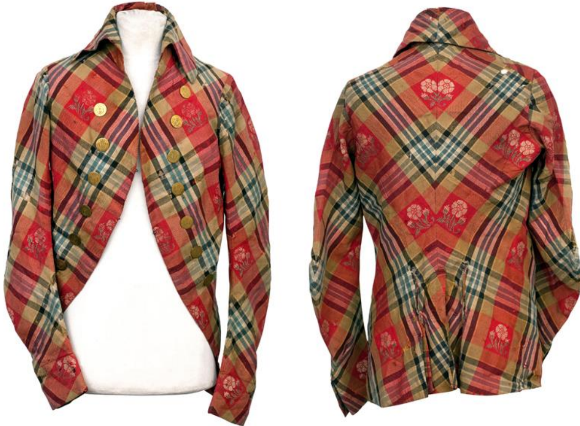
Plate 1. Late 18 th Century Coat belonging the Ancient Caledonian Society.

In 2018 this stunning late 18th century 1 tartan coat belonging to the Ancient Caledonian Society was secured at auction by the Scottish Tartans Authority (Plate 1).