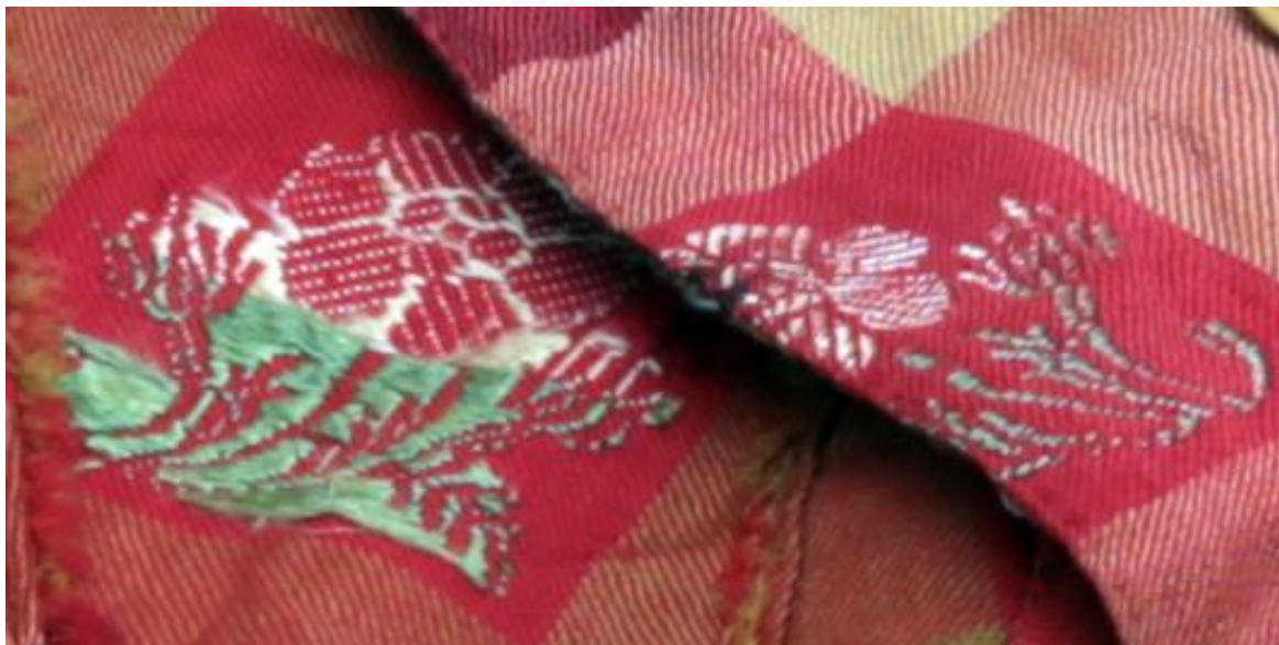
Plate 9. Internal and external detail of the silk brocade motif.

As the only known historical example of an augmented or decorated tartan pattern, and possibly of what was called Flowered Tartan , the coat is a unique piece of Highland Revival material culture. It is hoped that further research may discover more about the original owner of the coat and the Ancient Caledonian Society.