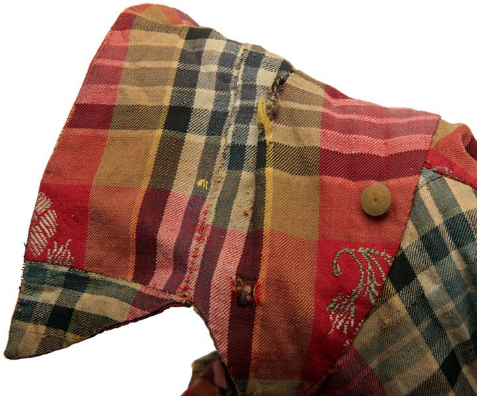
Plate 3. Plain button concealed below the collar about the left shoulder.

One button (top left as viewed – Plate 1) is missing, as are the two that would have been at the top of the rear vent. The cuffs are fastened by single, small plain brass buttons, whilst the purpose of the larger button covered by the collar on the left-hand side is unclear. It could possibly have been used to secure a plaid or sash (Plate 3).