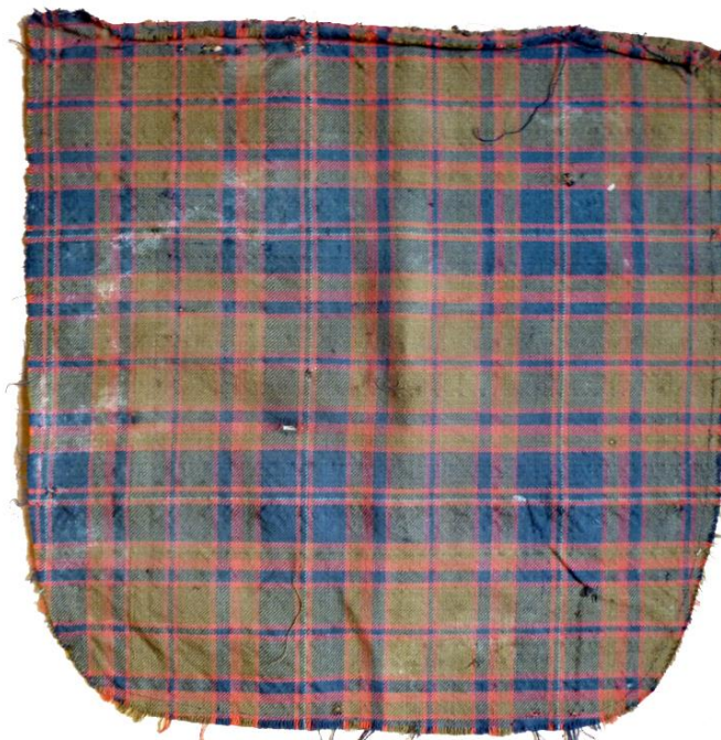
Fig 3. Plaid reused as a cushion cover.

In 1975 the author's family purchased an old coarse and dirty tartan cushion at a house sale in St. Fillans, Loch Earn in Perthshire (Fig 3). The material looked like Glenorchy and had obviously been reused; a fact confirmed when the cushion was taken apart.