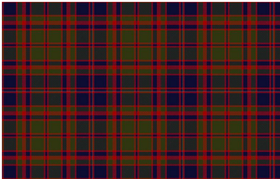
Fig 8. Glenorchy - Original setting.

Whilst there are a number of variations in the setting of the tartan the oldest and simplest is that from the original C18th plaid (Fig 8). With only one example it's impossible to know whether the setting was always asymmetric or if it was a one off but it is likely that this setting was the basis for Wilsons' early version included in the Cockburn Collection as Cumming , and that they quickly produced at least one 'fashion' variation, one or more of which was the source of later writers' versions listed under a variety of names.