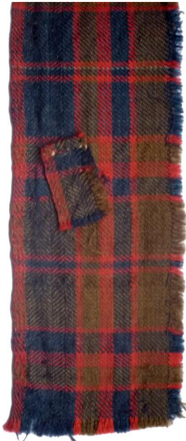
Fig 4. Herringbone selvedge detail.

Although only portion of the plaid survived there was enough to confirm the asymmetric setting and the fact that it was originally a joined plaid made from single width cloth with a herringbone selvedge comprising 4 x bands of 10 threads (Fig 4). The cloth is clearly hand woven and although quite fine it contains a number of threading errors in the warp that, together with the way it was arranged and joined, plus the dyes used, is consistent with tartan of the period c1700-50 (Fig 5).