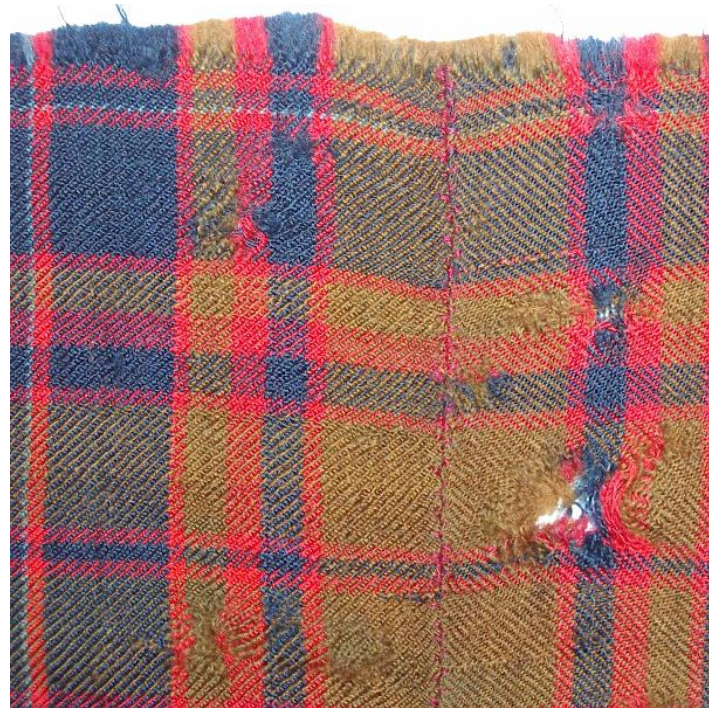
Fig 5. Detail of the join on the original plaid & threading errors.

Whilst clearly a version of the Glenorchy/MacIntyre/Cumming tartan, albeit that the green is very faded, this C18th specimen is similar to Wilsons' setting in the Cockburn specimen (see below). However, the earlier piece is structurally simpler in having only one light blue stripe and was made asymmetric by placing it at the edge of what is in Wilsons' and later settings the pivot. Mention has already been made of the extended setting of the Cockburn version.