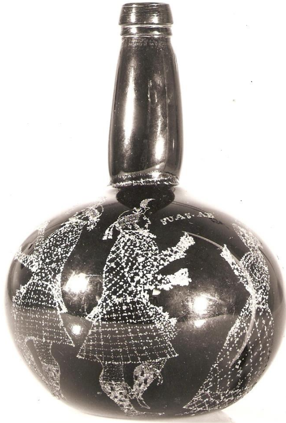
Fig 6. Marriage Bottle from Glentarken.

There is a further fascinating twist to the story of the plaid. The old cushion was found in a chest from Glentarken 5 together with a C19th whisky bottle engraved with a series of Highland figures and the date 1847 (Fig 6).