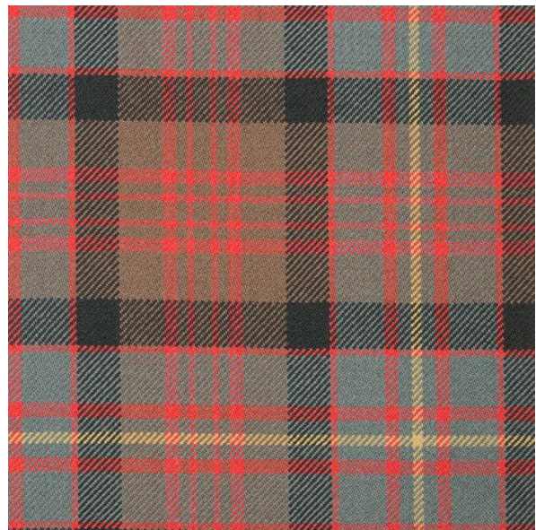
Figure 8. Cameron of Erracht in Weathered Colours.