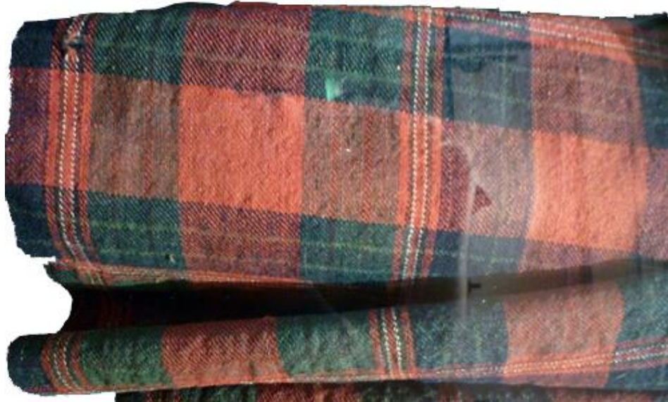
Figure 10. An 18 th century plaid in natural dyes.

When using natural dyes, either industrially or rurally, it was the common practice to counterbalance the colours against each other. The main colours used in a majority of extant 18th century pieces were a combination of some or all of the following; black, blue, red and green (Figure 10).