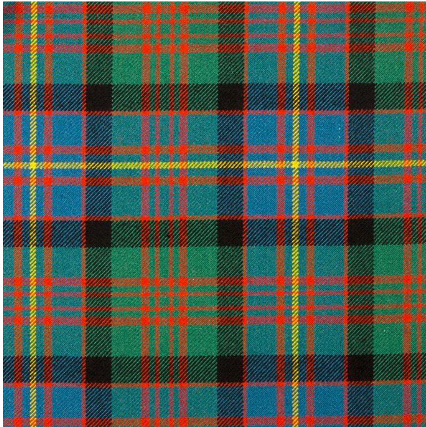
Figure 3. Cameron of Erracht in Old Colours.

These are the mid-light shades that are supposed to represent the colours obtained in the past from natural dyes, their use can be dated to the mid-1930s. A 1936 catalogue from Andersons (now Kinloch Andersons) described the range as exceedingly popular . In general, Old/Ancient colours do not reflect the shades obtained from the natural dyes which were used in old tartans. They are far too insipid in comparison and have a uniform paleness unrepresentative of the old highland specimens (Figure 3).