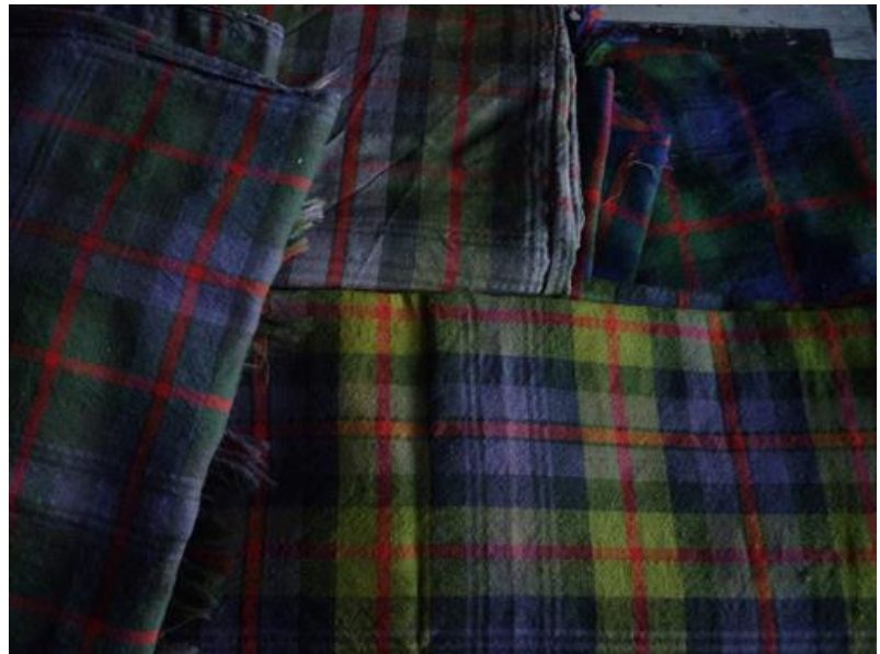
Figure 11. Wilsons' plaids c.1828-40 in natural dyes.

Reds at that time ranged from pink to scarlet and any shade was highly prized due to the cost of the imported dyestuff, cochineal. When a darker red was used as a ground colour, light red (pink) was sometimes used as a guard colour to highlight stripes or to separate ground colours in the same way as white, yellow and pale blue were used. The two colours that seem to have varied least were green and blue, the former usually being an olive shade whilst blue was often a mid-dark navy. Wilsons continued to use their colours in much the same way as the earlier rural dyers with mid greens juxtaposed by darker reds and blues (Figure 11).