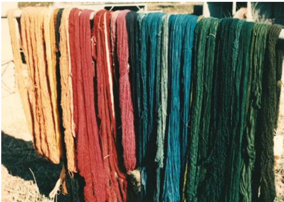
Figure 1. Examples of the colours available from natural dyes.

The reader should bear in mind that the colours used today are ALL produced using chemical dyes and that the natural dyes used until c.1856 could produce every colour and shade from light to dark depending on the type, quantity and quality of the dyestuff used and the desired effect (Figure 1).