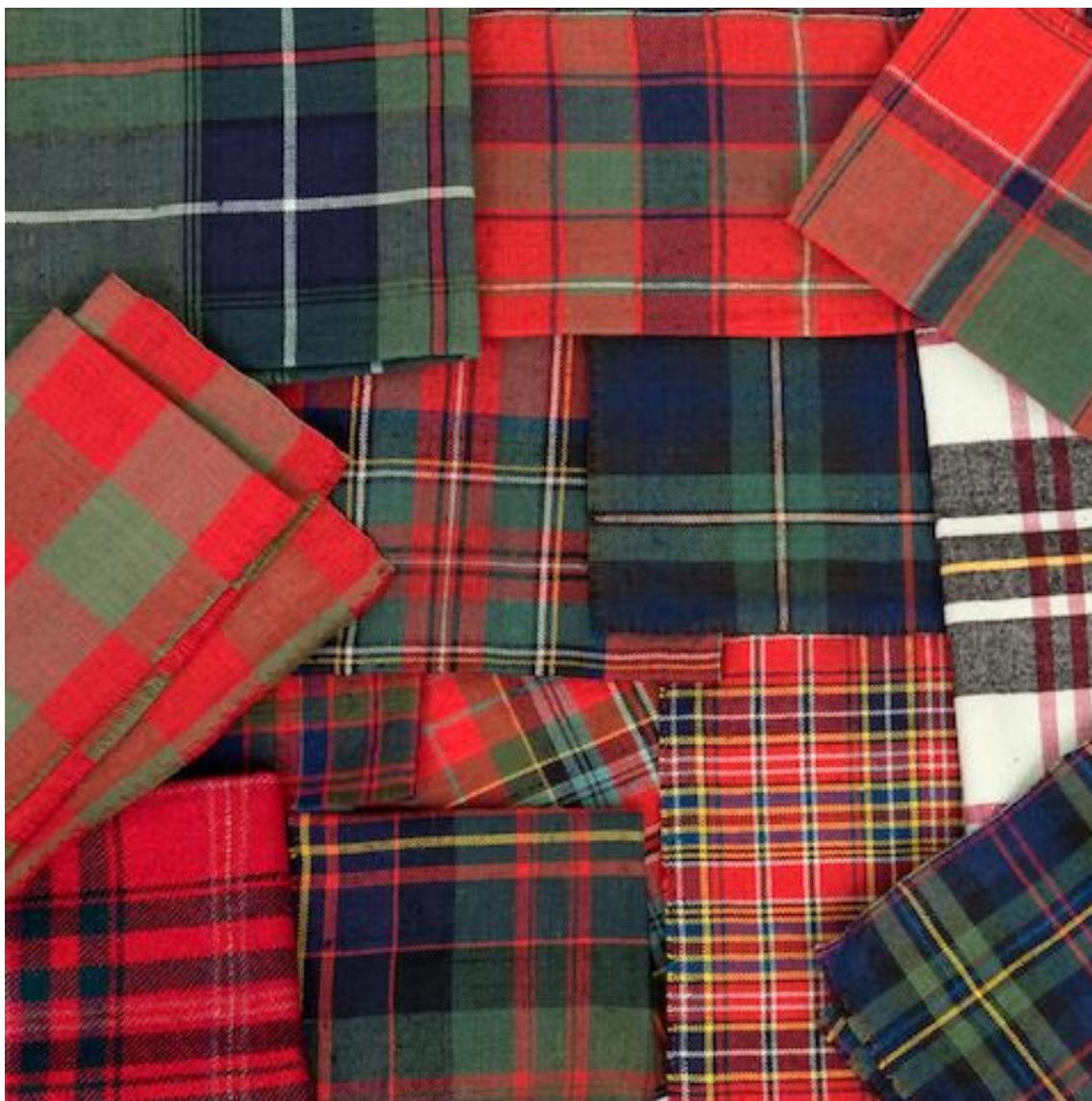
Figure 2. A collection of Wilsons of Bannockburn's natural dyed tartan specimens c.1820-40.

By the last quarter of the 18th century the famous weaving firm William Wilson & Sons of Bannockburn were working with large quantities of natural dyes to produce standard colours. They continued to develop these until the increasing availability of artificial dyes made natural ones uneconomic. The skill with which Wilsons produced their colours from natural dyes can still be appreciated by examining some of their many surviving specimens (Figure 2) and studying their dye recipes. 1 These recipes combined both traditional Highland dyes, such as native Cudbear 2 and imported Cochineal with newer imported dyes like Fustic. 3