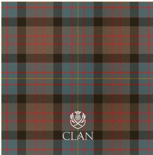
Figure 7. Cameron of Erracht in Reproduction Colours.

The main differences are that with Reproduction shades that the usual blues become slate blue, black a less intense charcoal black, red a deeper shade and green a sort of khaki (Figure 7). In the Weathered range the blue become grey and green becomes brown whilst the red is closer to the scarlet/orangey shade found in Old colours (Figure 8).