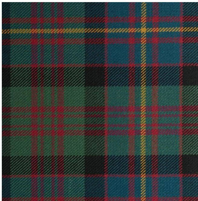
Plate 6. Cameron of Erracht in Muted Colours.

These are of fairly recent origin, from the early 1970s, and fall somewhere between the Old and Modern colour ranges (Plate 6). Broadly speaking, they are the best commercial match to the overall shades of natural dyes used prior to 1856. Once again, the problem with this palette is that the shades are of a uniform hue and therefore inconsistent with the old practice of counter balancing shades.