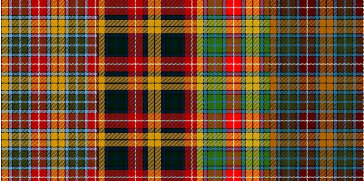
Figure 12. The Buchanan tartan in Wilsons' (natural dye), Modern, Old and Weathered Colours showing how the pattern remains unchanged.

It is import to understand that changing the shades does not change the colour and therefore the tartan (Figure 12). No one colour range is more correct than another unless the intent is to replicate a tartan for a particular period. For example, as a broad range, both Old Colours and Weather Colours are historically incorrect when trying to replicate tartans of the Jacobite period.