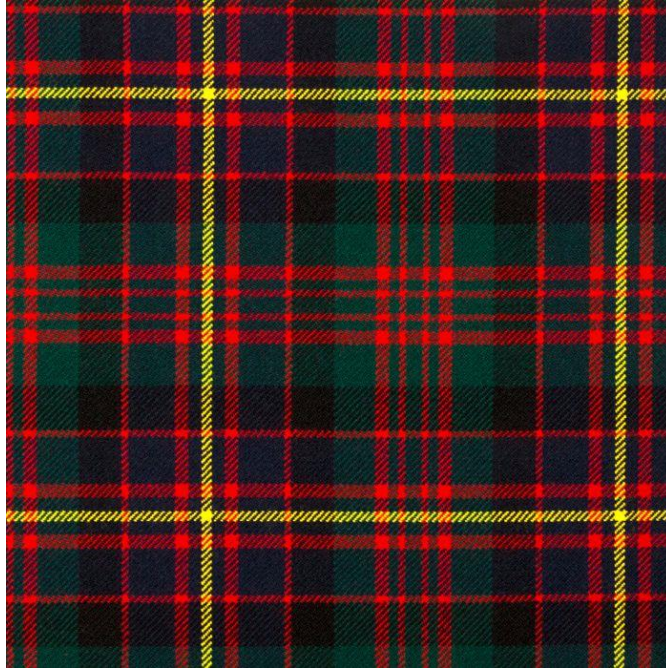
Figure 5. Cameron of Erracht in Modern Colours.