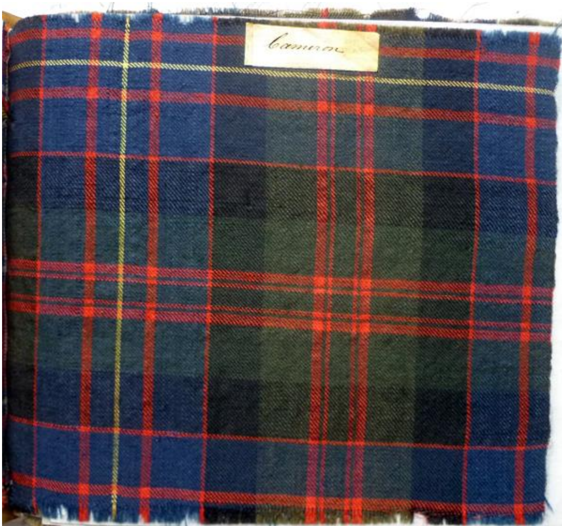
Figure 9. Cameron (of Erracht) by Wilsons of Bannockburn in natural dyes c.1830.

As a result of the failure of the '45 Jacobite Rising, Highland Dress was proscribed for a period of 35 years '.....in that part of North Briton called Scotland' 7 i.e., the Highlands. This led to the skills needed to spin, dye and weave tartan disappearing completely from much of the Highlands within fifty years. That the traditional skills were not completely lost is evidenced by the survival of a number of plaids dated during the mid-1770s and the fact that tartan production, initially for the huge number of Highland Regiments, moved to the Lowlands and in particular, to the firm of Wm Wilson & Son of Bannockburn. They scoured the Highlands for old patterns and by 1780 were working with stock patterns and colours based on historic examples, for example; Cameron (of Erracht) (Plate 9).