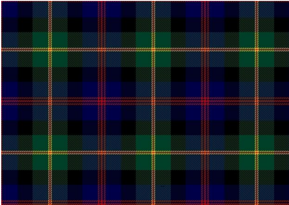
Fig 2. Revised reconstruction to show the original setting.

This reconstruction was subsequently confirmed as correct when a third, very small, fragment purchased by the NMS was examined and proved to confirm the portion of the pattern that had previously merely been projected based on the most logical structure. The three fragments are shown relative to each other in Fig 3.