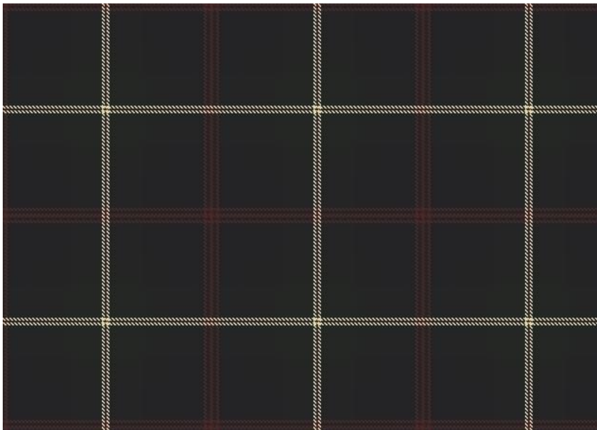
Fig 1. Reconstruction of the Stonyhurst specimen.

Examination of the SH specimen revealed that the sample was consistent with a pre-c1800 date and more likely 1700-50. The tartan was very dark, so much so that it was difficult easily to distinguish between the blue and black. The sample was also too small to be completely certain that the full repeat of the threadcount was possible, however, based on the information I produced a tentative reconstruction – shown in Fig 1.