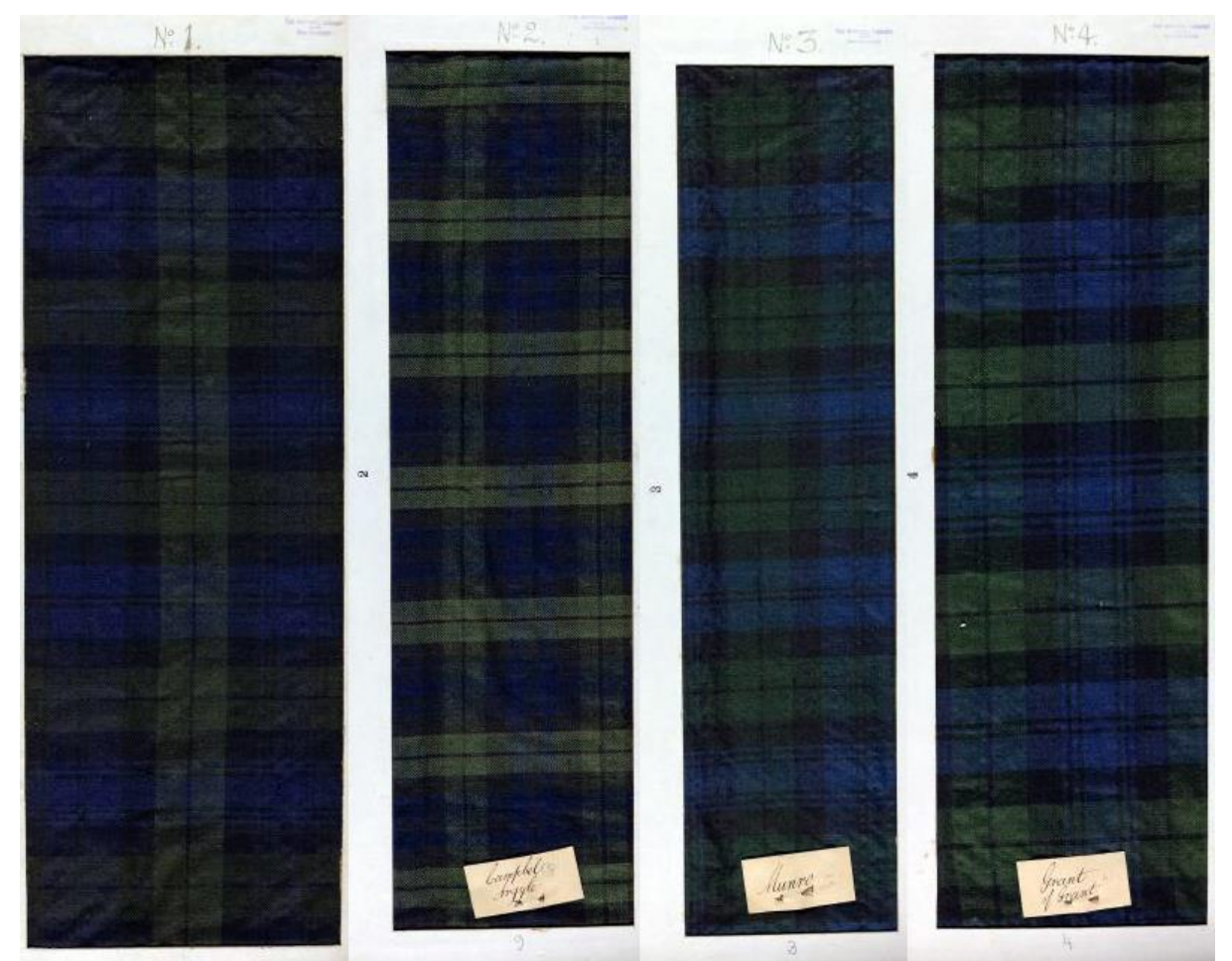
Plate 3. Nos.01-04 Sutherland; Campbell of Argyll; Munro; and Grant of Grant.

Low-res images of the tartans are available online.<sup>2</sup> Several of the tartans bear names that differ from those use today, for example; MacLaine of Lochbuie is labelled as Sinclair. There are two specimens of Royal Stewart, one of which is labelled MacDonald of Clanranald; two specimens of Wilsons' MacKintosh tartan labelled as 'McIntosh' and 'MacPherson', Nos 54 and 55 respectively. And, there are four pieces of the Government tartan (commonly called the Black Watch) labelled Nos 1-4 as: Sutherland; Campbell of Argyll; Munro; and Grant of Grant (Plate 3).