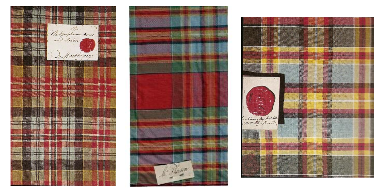
Plate 4. MacPherson (HSL); MacPherson (Cockburn); MacKintosh (HSL).

Cockburn presumably obtained some, possibly all, of his specimens from Wilsons though whether this was directly or through an agent is not known. The samples date from the period when the concept of clan tartans was in its infancy; a time when patterns were being designed, shared and reused. It is not clear whether the labels were attached to the samples when Cockburn acquired them, or whether they were his 'best guess'. In some cases, the names, or pattern, differ from those sealed by the chief of the name in the HSL's collection between 1816-22. A good example of this is the MacPherson tartan. The chief sealed another Wilsons' tartan, Pattern No.43, Kidd or Caledonia as that of the clan whereas the Cockburn specimen matches what Wilsons were selling as MacKintosh at the time and which was sealed by MacKintosh of MacKintosh as his clan tartan in the HSL's collection (Plate 4).