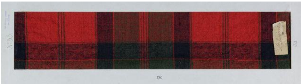
Plate 2. No.33 MacQuarrie.

Low-res images of the tartans are available online.<sup>2</sup> Several of the tartans bear names that differ from those use today, for example; MacLaine of Lochbuie is labelled as Sinclair. There are two specimens of Royal Stewart, one of which is labelled MacDonald of Clanranald; two specimens of Wilsons' MacKintosh tartan labelled as 'McIntosh' and 'MacPherson', Nos 54 and 55 respectively. And, there are four pieces of the Government tartan (commonly called the Black Watch) labelled Nos 1-4 as: Sutherland; Campbell of Argyll; Munro; and Grant of Grant (Plate 3).