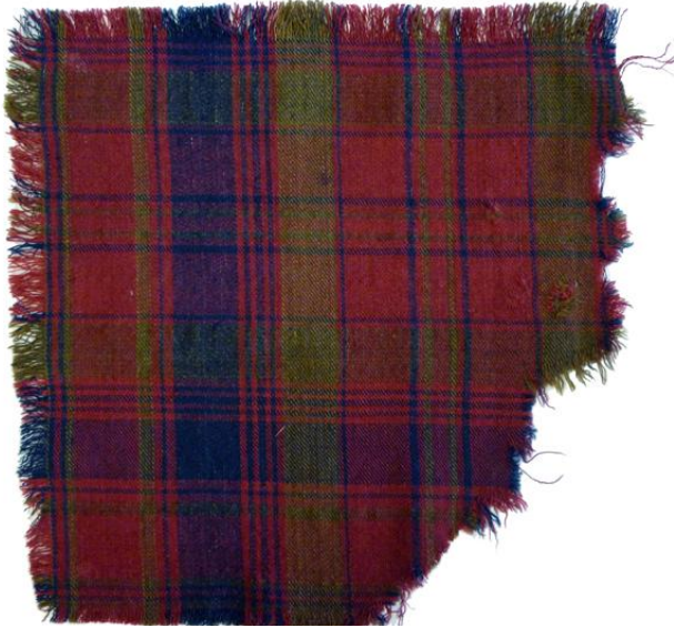
Fig 1. Original fragment.