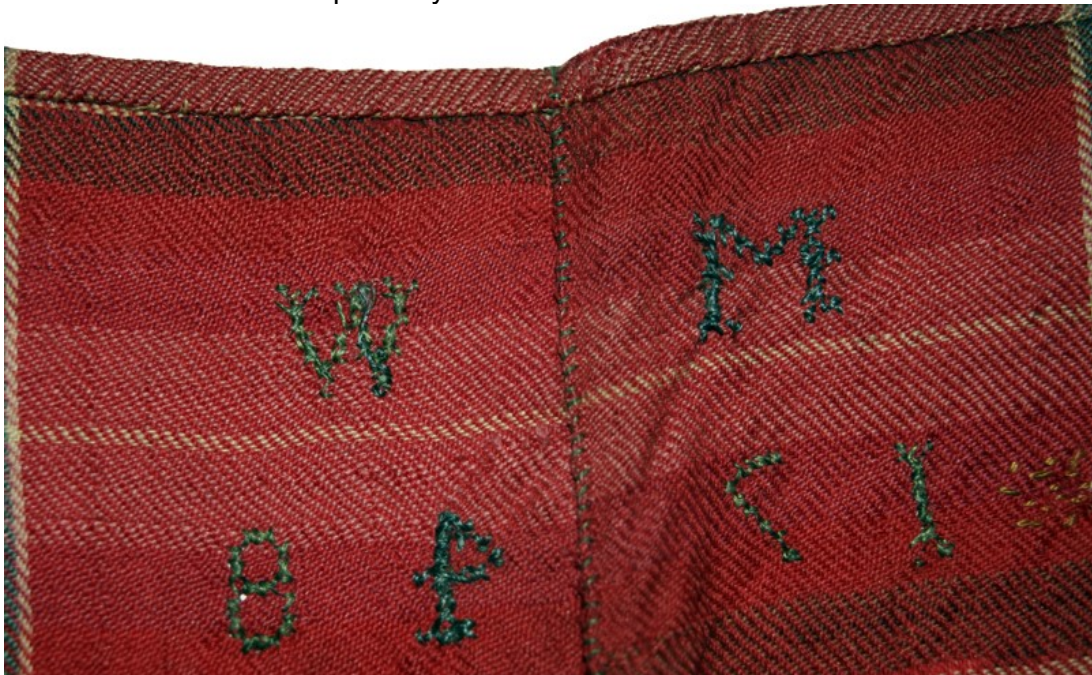
Fig 4. Overview of the join, initials turned end showing the different thread used.

The linen yarn used to join the two pieces and for embroidering the date and initials differs from that used turn the ends of the plaid (Fig 4). The presence of the joining thread in seam in the rolled ends confirms that the two halves were first joined and ends turned and sewn down afterwards. This turning was done with a paler thread that more closely matched the tartan shades and which was probably intended to be unobtrusive.