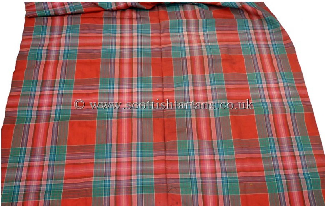
Fig 1. Joined plaid initialled and dated.

Throughout this paper, the term plaid 1 is used to describe this artefact; however, it is not suggested that this was a male belted plaid. The size, quality, lack of wear and the fact that it is initialled and dated are indicative of its use as a decorative piece, for example, as a bed cover.