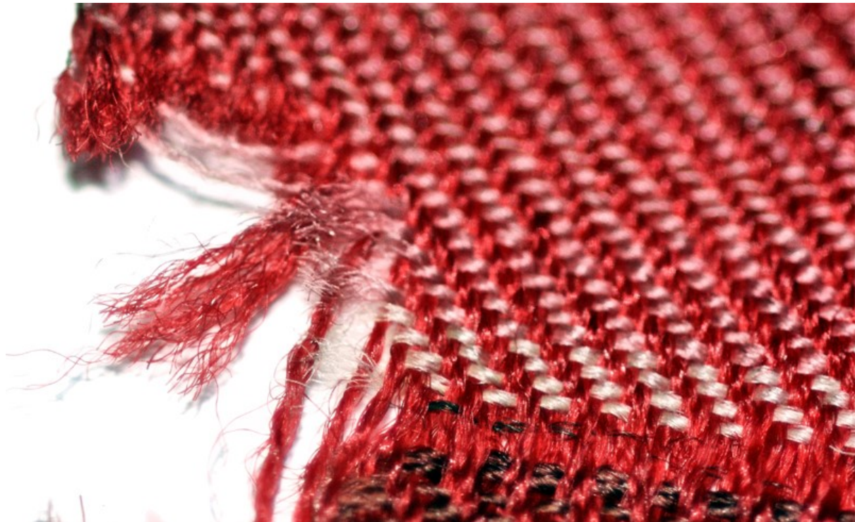
Fig 2. Detail of the warp and weft singles yarn.

The joined plaid measures 100 x 54 inches comprising two pieces of 27-inch-wide cloth joined selvedge to selvedge using a whip stitch and the rough (non-selvedge) ends turned and sewn down to prevent fraying. Woven at approximately 76 epi, the cloth has a balanced sett 3 with 4 half repeats across the of the warp giving 8 half setts (4 full repeats) across the width of the joined material. The yarn is single spun in both warp and weft and naturally dyed (Fig 2).