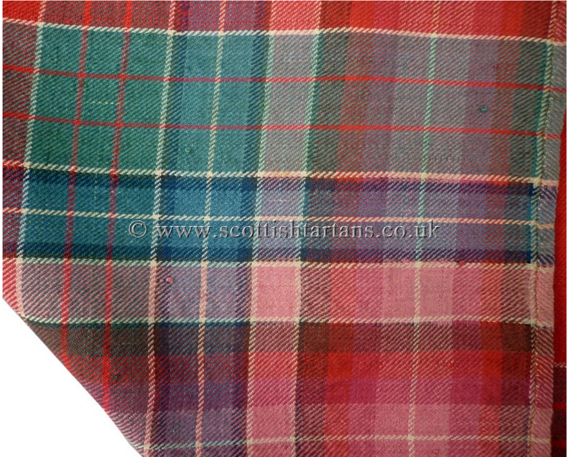
Fig 3. Detail of the 9 colours and shades in the plaid.

The linen yarn used to join the two pieces and for embroidering the date and initials differs from that used turn the ends of the plaid (Fig 4). The presence of the joining thread in seam in the rolled ends confirms that the two halves were first joined and ends turned and sewn down afterwards. This turning was done with a paler thread that more closely matched the tartan shades and which was probably intended to be unobtrusive.