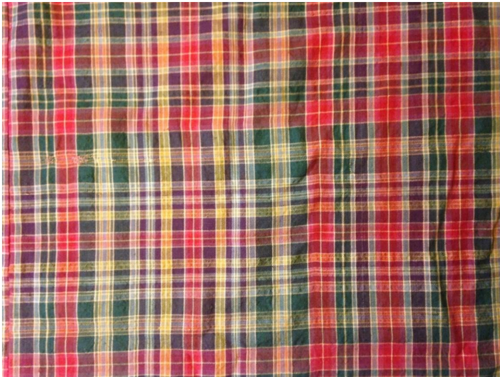
Fig 1. The 'fancy' tartan sent for identification.

In 2014 The Scottish Tartans Authority (STA) was contacted by a lady who wanted to know more about a length of tartan that family tradition said dated to the 18 th century. The photo of the piece that accompanied the enquiry appeared to show a typical 'fancy' pattern of the type woven by Wilsons of Bannockburn during the late 18 th and early 19 th centuries (Fig 1). However, beyond an indication that the shades and sett were typical Wilsons' little else could be determined until the piece was examined in detail.