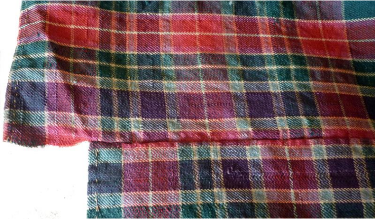
Fig 3. Shortened section as a result of patching and showing the difference in sewing quality.

The plaid/shawl is 6' 6" long x 22.5" wide, superbly dyed and finely woven at 54 epi with single (unplied) yarn in both warp and weft. The width is marginally narrower but when considered with quality of the material and the colours it is typical of Wilsons' Fine Cloth , a number of settings for which were included in their 1819 Key Pattern Book. There is some significant moth or other form of damage in a couple of places which has been patched with a piece taken off the end of one of the lengths making it slightly shorter (Fig 3). Although the shortened section has been turned and sewn in the traditional fashion the quality of the latter sewing is poorer and less dense than the original. This can also be seen in the picture.