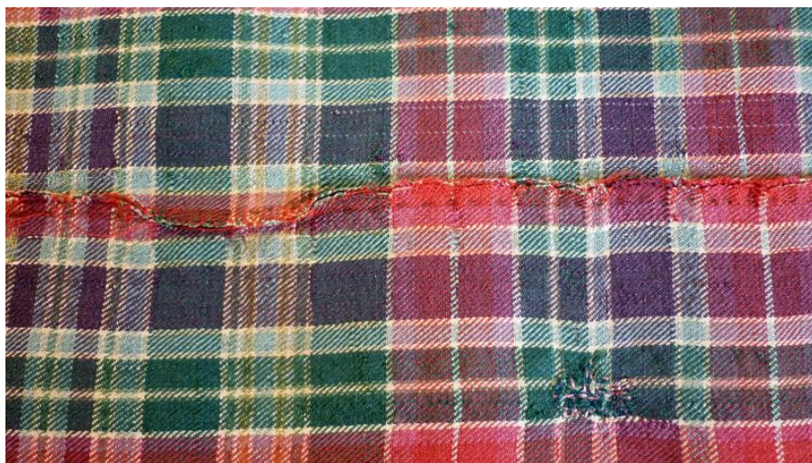
Fig 4. The centre join with running stitch and associated seam.

Plaids were normally joined with a simple 'whip stitch' although sometimes a more decorative stitch was used. In each case the stitch allowed the joined cloth to be flattened at the seam so that the full effect of the pattern repeat flowed across the whole piece. In this plaid the two lengths were aligned side by side and a basic running stitch used meaning that there was always a seam in the centre of the cloth and the pattern does not repeat exactly (Fig 4).