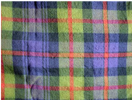
Fig 1. Wilsons’ Athole tartan with purple.

By 1820 Wilsons’ records list nearly 300 tartans, the majority of those were merely numbered, some had town or district names and by then an increasing number, clan or family names. However, examination of their pre-1800 patterns shows that with the odd exception in the era before the development of clan tartans the vast majority of named tartans were either military or called after towns, district or regions. Wilsons realised that named patterns sold better and so used Scottish place names to promote their goods. So for example, writing of the Aberdeen tartan they said ‘This Pattern was made and named after the City of ABERDEEN about the middle of the 18 th Century’ . There is nothing in their records to suggest that they ever considered these tartans to be old patterns or to have an historical connection to the places that bore their name. In fact almost all of the tartans are connected with towns and areas in the Lowlands which confirms their fashion status rather than them being sold as having some pseudo-historical Jacobite/Highland connection.