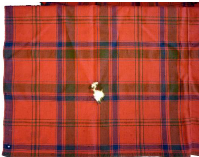
Fig 5. Portion of an unnamed C18th plaid in the STA Collection.

In terms of structural development, although not necessarily age, the plaid at Glencoe is the simplest of the three designs in that the basic pattern that can be described as being rendered simply in red and green. In the smaller Glencoe specimen (now called MacColl) the design is developed by changing the broad stripe and accompanying guards of the green band to blue and brown respectively but without altering the sett. By retaining the basic pattern but stripes the number of permutations of the design is