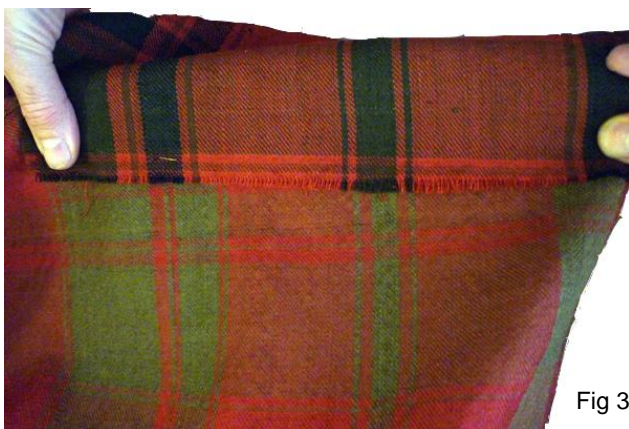
Fig 3. The two Glencoe Museum pieces showing the similar setting.

different proportions. Because they are part of the museum exhibit it was not possible to remove the plaid to examine it fully however, it comprises two lengths of off-set cloth 24" wide with a herringbone selvedge joined in the traditional manner to make a double width plaid. The origin of the plaid is unclear but the fact that this a local history museum, the similarity in the age of the cloth, yarn weight and weave, including herringbone selvedge, all suggest that the two specimens are probably from the same weaver and off the same loom.