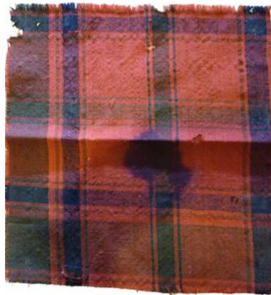
Fig 2. Fragment of C18th plaid (Glencoe Museum)

There are a number of extent plaids and fragments of early tartan spread throughout the country and whilst many appear similar, they're often predominately red blue and green, they differ in their setting. It is therefore extraordinary to find another example, also in the Glencoe Museum, that has the same setting but woven in just red and green and in slightly