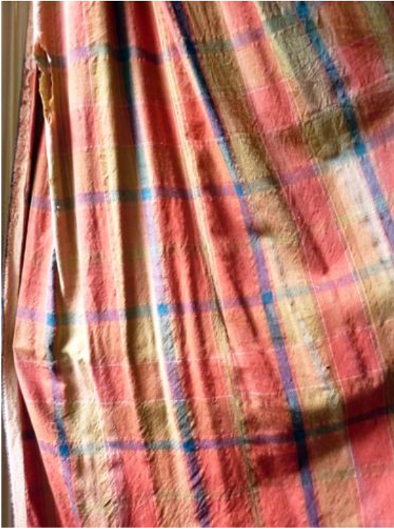
Fig 4. The Dunollie Plaid in use as curtains.

If survival of two specimens were not remarkable enough then the discovery of a whole, albeit cut into two, early 18 th century plaid from the same region and which has the same basic structure is extraordinary (Fig 4). Details of the find are outlined in a companion paper that discusses the find at Dunollie House, Oban. The plaid, which had been used for the past 200 years by the chief of the MacDougalls for curtains, is probably the oldest surviving complete example of a 6 yard double fine plaid. Although somewhat faded the sett is clearly discernible and quite obviously what might be described as a decorated version of the setting in the Glencoe specimens. The term 'decorated' refers to the basic structure or setting (in this case that of the Glencoe pieces) being enhanced or lived up by the addition of finer lines of brighter colours. Such 'decoration' is typically found amongst many 18 th century specimens.