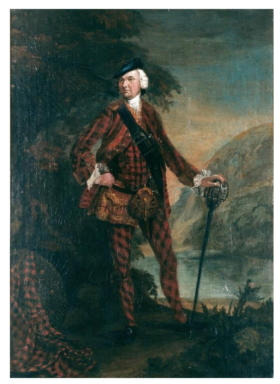
Plate 6. MacGregor of Glengyle c1740-50 Unknown artist

Glengyle<sup>6</sup> is pictured wearing a waistcoat and trews of black and red dice, a plaid of the same tartan lies close by while his jacket is of a more complex red and black (possible blue and/or green) with evidence of finer overstripes. This mix of tartans together with other elements of the dress suggest that it was painted from life in which case, it is reasonable to postulate that these were Macgregor's own cloths rather than studio props. The possibility that MacGregor may have worn his own clothes does not mean that these were regarded as either a Glengyle or broader MacGregor tartan at the time.