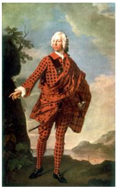
Plate 4. Norman MacLeod 22nd Chief by Allan Ramsay c1748

Irrespective of portrait's origins, it and Ramsay's contemporary portrait of David, Lord Ogilvy (Plate 3) are the earliest representations of the black and red tartan worn in clothing, other than hose<sup>3</sup>. Ogilvie was probably painted in Sep 1745 when Ramsay was summoned to Edinburgh and Charles was painted around the same time during the period he held Court at Holyrood. Shortly after the failure of the '45 Ramsay painted another two portraits<sup>4</sup> in which the subject wears a similar outfit of jacket and trews in the black and red check: Norman MacLeod of MacLeod, 22<sup>nd</sup> Chief (Plate 4) and Francis, 7<sup>th</sup> Earl of Wemyss (Plate 5). Wemyss also wears a plaid in the same tartan whereas MacLeod's plaid is Murray of Tullibardine.