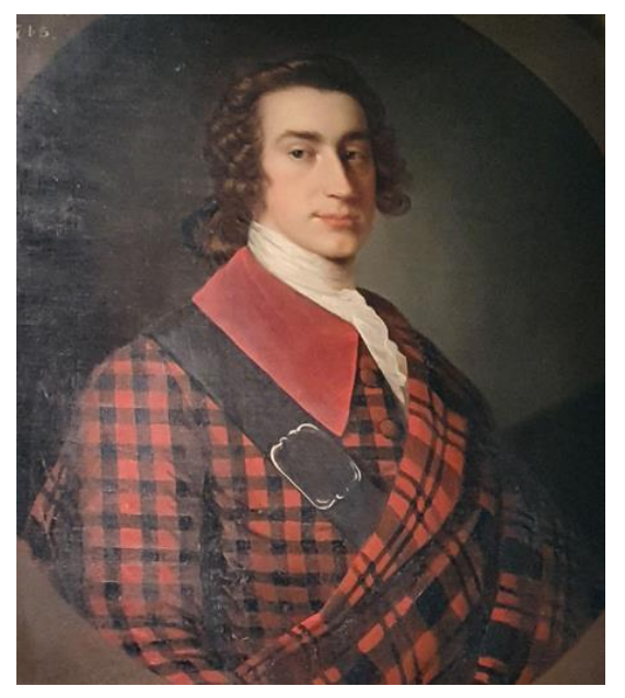
Plate 3. David, Lord Ogilvy by Allan Ramsay 1745

Irrespective of portrait's origins, it and Ramsay's contemporary portrait of David, Lord Ogilvy (Plate 3) are the earliest representations of the black and red tartan worn in clothing, other than hose<sup>3</sup>. Ogilvie was probably painted in Sep 1745 when Ramsay was summoned to Edinburgh and Charles was painted around the same time during the period he held Court at Holyrood. Shortly after the failure of the '45 Ramsay painted another two portraits<sup>4</sup> in which the subject wears a similar outfit of jacket and trews in the black and red check: Norman MacLeod of MacLeod, 22<sup>nd</sup> Chief (Plate 4) and Francis, 7<sup>th</sup> Earl of Wemyss (Plate 5). Wemyss also wears a plaid in the same tartan whereas MacLeod's plaid is Murray of Tullibardine.