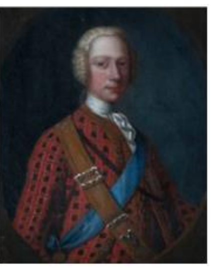
Plate 2. Prince Charles Edward Stuart wearing the black and red tartan c1745-6.

Jacobite Army at Culloden (Plate 2). The portrait<sup>2</sup> looks to have been painted from life but it is not clear when or where it was produced nor if the Prince actually wore the outfit or whether it was a form of romanticised Jacobite propaganda.