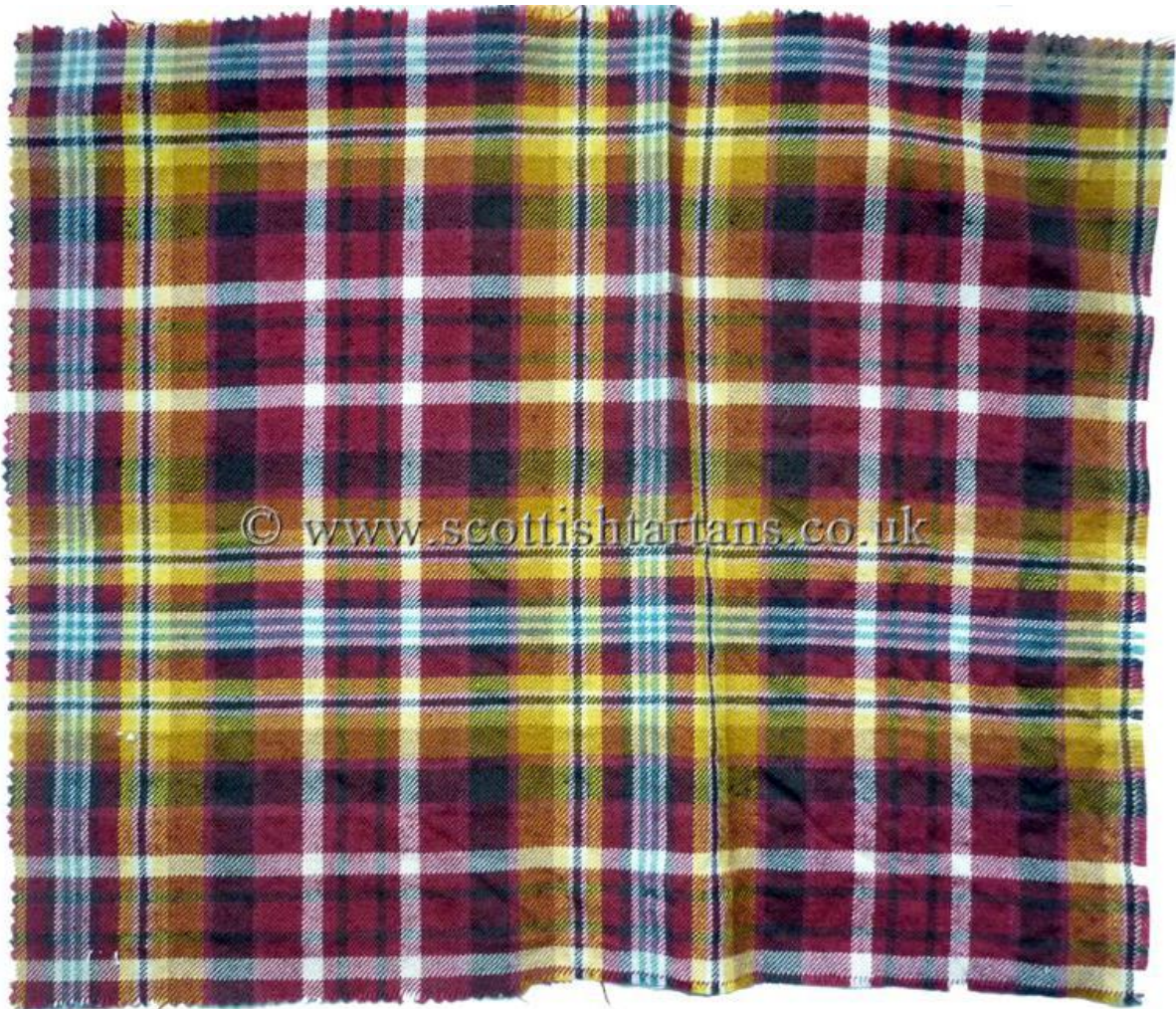
Plate 5. A specimen of the so-called Jacobite, Old tartan c.1800-50.