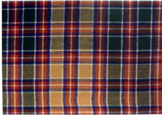
Plate 3. Highland Society of London 1906-34

The inclusion of the same white-red-blue-white stripe combination on each pivot and to separate the ground colours, those areas themselves relatively small, makes the pattern appear crowded and busy. Such mirror patterns 4 were popular in the early 19 th century but much less so in the mid-18 th century and it is very unlikely to have been used as this W & A K Johnston postcard imagined. (Plate 4).