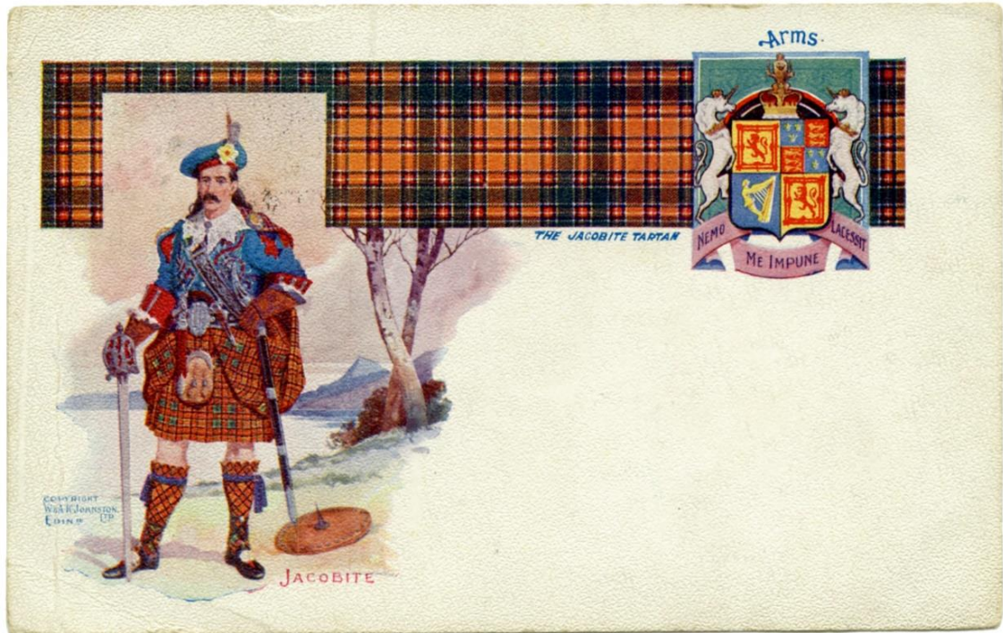
Plate 4. The Jacobite Tartan, W & A K Johnston postcard, 1906