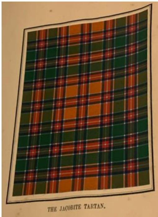
Plate 1. Smiths' plate of The Jacobite Tartan.

Whenever members have been engaged in conspiracies, whether for the purpose of obtaining their own rights, or invading the rights of others, secret words, signs, and emblems whereby they could recognise each other have been adopted; and previous to the rising of '15, the Tartan pattern here given was worn as one of the emblems of the Jacobites. We had it from a lady of rank, who has still in her possession a silk scarf of it which was manufactured in 1712 for a lady who was a most zealous Jacobite, and whose eldest son followed "Prince Charlie" in '15. The uniform tradition which has accompanied this scarf, has always represented it as "The Jacobite Tartan" (Plate 1).