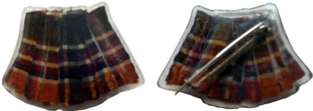
Plate 6. A piece of Jacobite Tartan made into a badge for the Scottish patriot, Wendy Wood.

Notwithstanding the doubtful history of the design, the story of the Jacobite Tartan being a secret symbol made it a logical choice for Wendy Wood, the famous Scottish patriot, to adopt as a symbolic badge. She has a piece of the tartan sealed in plastic, a novel idea at the time, and a pin attached so that she could wear it proudly (Plate 6).