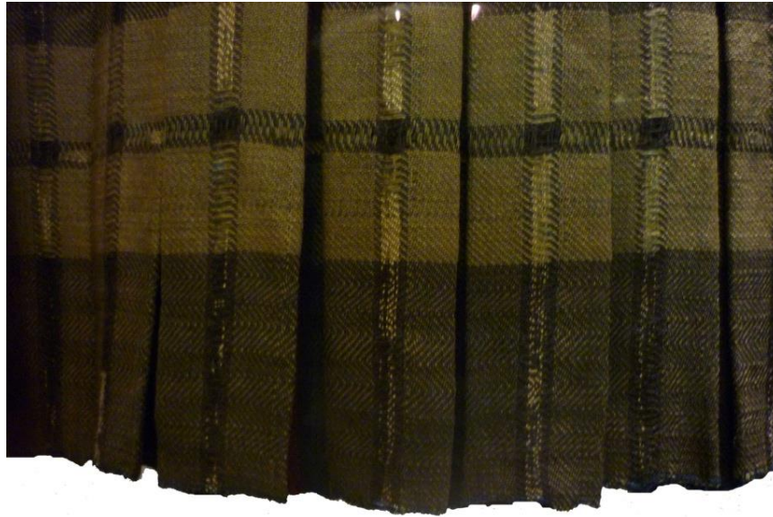
Fig 7. Black herringbone selvedge mark on a c1820 78 th Regiment kilt.

runs were being ordered from the Lowland weavers. Early 19th century threadcounts for military cloth included specifications for selvedge marks on plaids for the 42 nd , 78 th , 79 th , 92 nd and 93 rd regiments 3 . This practice continued until about 1810-15 when the belted plaid was dropped in favour of the kilt for all uses. The fact that plaid material was sometimes used for kilts during the early 1800s is evident from the Officers' weight cloth used in a c1810-20 kilt with a broad black herringbone selvedge mark (Fig 7).