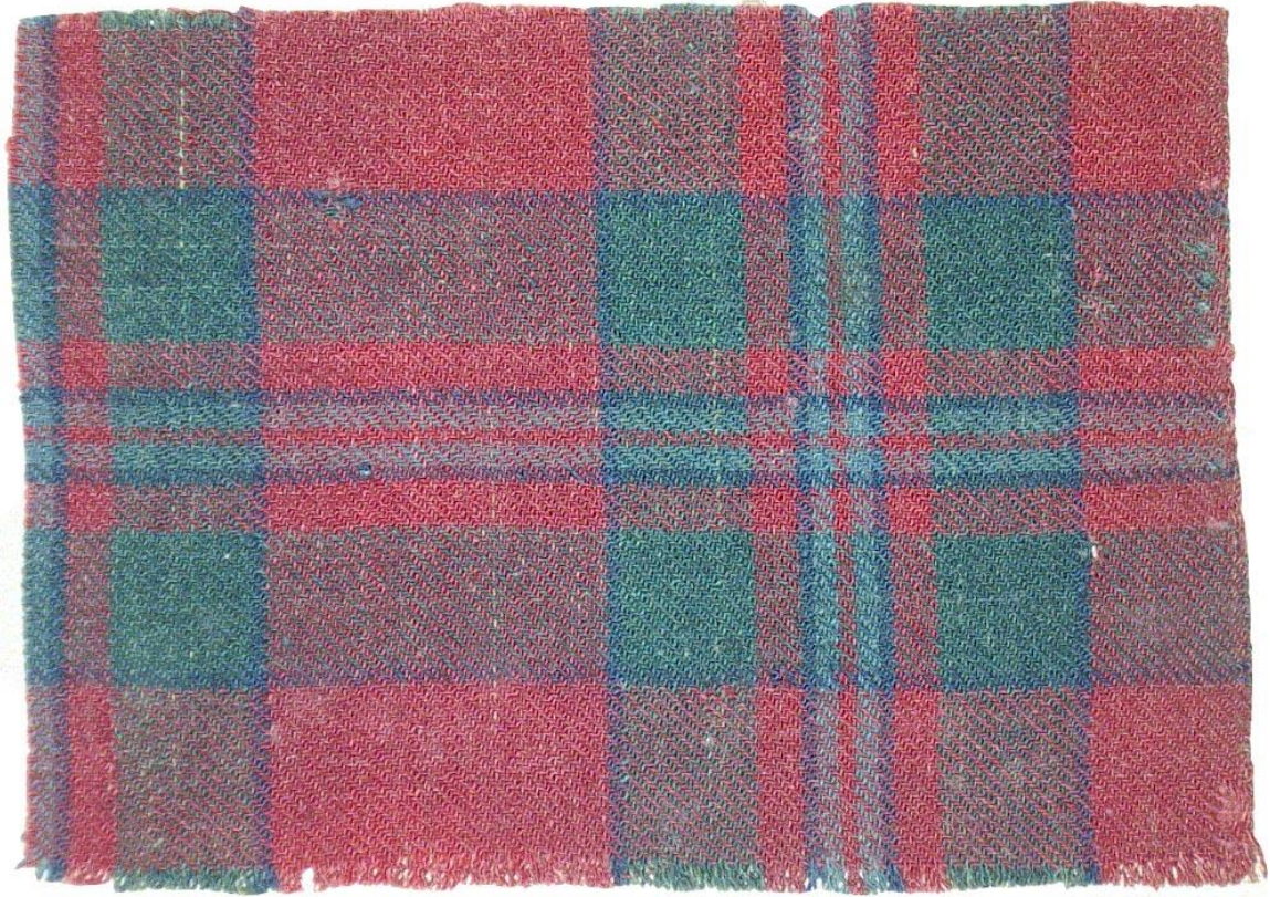
Fig 4. C18th specimen with a basic twill weave selvedge.

Mention has already been made of the use of herringbone selvedges. These are often found on old plaids, although not all old plaids were woven with a herringbone selvedge. Examples show that it was used on both plain and decorated selvedges well before the mid-C18th. The effect of a herringbone is to make that section slightly thicker and looser so it probably had a dual function, principally of being decorative but also of allowing the fabric to move or flow more effectively which might have been an added advantage in a belted plaid. Herringboning was generally one to three inches wide with about two inches being most common width. The individual bands were generally 8-10 threads with 4 to 8 bands in most herringbone selvedges. Fig 5. shows a portion of a 18th Century plaid sett that finishes with a herringbone selvedge.