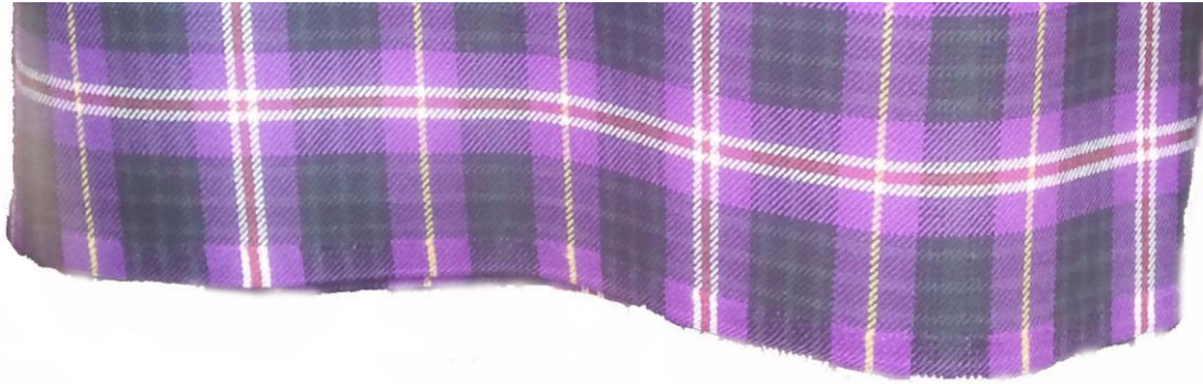
Fig 2. Turned edge on a modern kilt with the line of the turned in threads visible.

In traditional tartan weaving the selvedge is generally of a plain 2/2 twill weave that is the same thickness as the rest of the cloth. In old specimens the tartan either repeated to the edge of the cloth or some form of selvedge mark or border pattern was included, depending on how the cloth was intended to be used. Many pre-1800 rural plaids for example, featured a herringbone selvedge. A selvedge mark or border pattern is a form of decorated selvedge and was only used for plaids, domestic blankets and, in the early C19th, a selvedge mark was sometimes added to military kilt cloth. Material for general clothing was always woven in undecorated twill with the pattern repeating from the centre to both edges and finishing with a plaid twill selvedge (Fig 3).