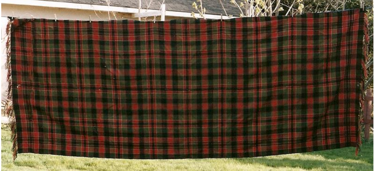
Fig 10. An example of a plaid with a Total Border.

But for the chance discovery of two plaids in Nova Scotia it might have been assumed that these selvedge patterns were restricted to white (arisaid) type domestic blankets. Full details of these plaids are here but for the purposes of this paper this important point is that both, one single width and one a joined plaid, are all tartan (as opposed to a white arisaid sett) and are surrounded by a complete border of a different sett (Fig 10).