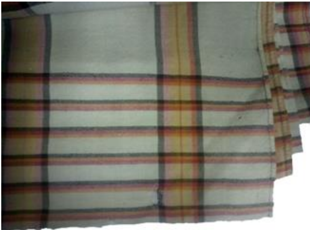
Fig 9. Christina Young blanket showing the double barred selvedge pattern.

Undoubtedly the best example of a white based plaid is that woven by Christina Young, initialled CY and dated 1726. The complete plaid survives which, with a 36" warp, is unusually wide for tartan of that era and the finished 72" blanket has a rare double bar selvedge pattern that is also herringboned over the full 8" width (Fig 9). Christina was from Aberdeen, not an area traditionally associated with tartan weaving, is said to have woven this for her wedding so perhaps it was a form of dowry. It is likely to have been used as a bed cover or surround.