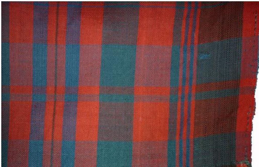
Fig 6. c1800 plaid with a black herringbone selvedge mark.

Selvedge Marks are a form of decoration where the pattern is off-set and the sett repeats from the middle of a pivot on one selvedge towards the second where a broad band of colour is added. Sometimes the band was one of the colours in the tartan, usually blue or black, or in red, blue and green setts a black band was sometimes added. The band either ran to the edge of the cloth or, there was a fine, usually red, stripe right at the edge as in this example. It is an example of a fine c1800 Murray of Tullibardine plaid that includes a broad black selvedge mark with the herringboning running through and into the red (Fig 6). This plaid was a copy of a much older one which it is assumed would also have had the selvedge mark.