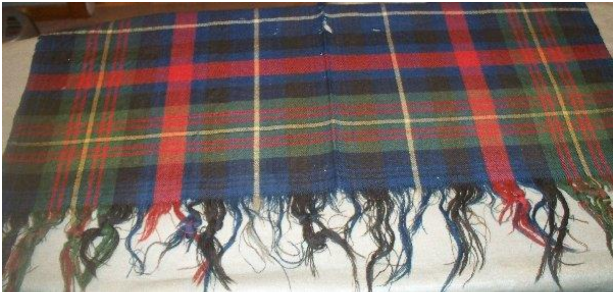
Fig 3. An early C19th example of a balanced weave with the sett repeating evenly from the centre to each selvedge.

In traditional tartan weaving the selvedge is generally of a plain 2/2 twill weave that is the same thickness as the rest of the cloth. In old specimens the tartan either repeated to the edge of the cloth or some form of selvedge mark or border pattern was included, depending on how the cloth was intended to be used. Many pre-1800 rural plaids for example, featured a herringbone selvedge. A selvedge mark or border pattern is a form of decorated selvedge and was only used for plaids, domestic blankets and, in the early C19th, a selvedge mark was sometimes added to military kilt cloth. Material for general clothing was always woven in undecorated twill with the pattern repeating from the centre to both edges and finishing with a plaid twill selvedge (Fig 3).