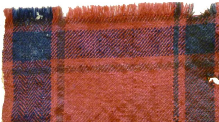
Fig 5. A C18th repeating sett with herringbone selvedge.

Mention has already been made of the use of herringbone selvedges. These are often found on old plaids, although not all old plaids were woven with a herringbone selvedge. Examples show that it was used on both plain and decorated selvedges well before the mid-C18th. The effect of a herringbone is to make that section slightly thicker and looser so it probably had a dual function, principally of being decorative but also of allowing the fabric to move or flow more effectively which might have been an added advantage in a belted plaid. Herringboning was generally one to three inches wide with about two inches being most common width. The individual bands were generally 8-10 threads with 4 to 8 bands in most herringbone selvedges. Fig 5. shows a portion of a 18th Century plaid sett that finishes with a herringbone selvedge.