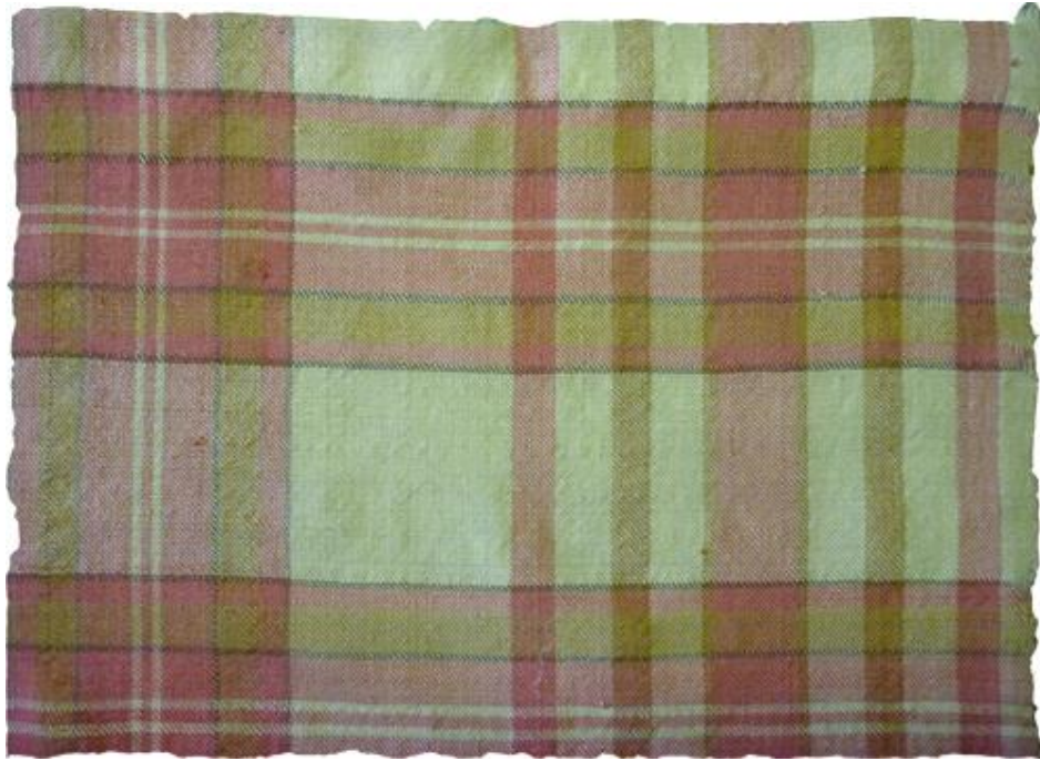
Fig 8. A typical selvage pattern on an early C18th barred blanket.

Undoubtedly the best example of a white based plaid is that woven by Christina Young, initialled CY and dated 1726. The complete plaid survives which, with a 36" warp, is unusually wide for tartan of that era and the finished 72" blanket has a rare double bar selvedge pattern that is also herringboned over the full 8" width (Fig 9). Christina was from Aberdeen, not an area traditionally associated with tartan weaving, is said to have woven this for her wedding so perhaps it was a form of dowry. It is likely to have been used as a bed cover or surround.