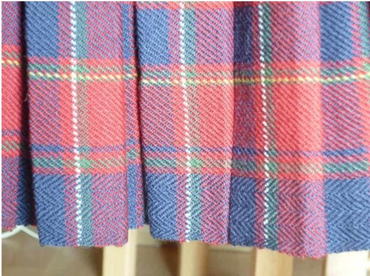
Fig 11. Modern kilt with herringbone selvedge.

Today these traditional selvedge techniques are generally unknown on commercial cloth and so the reader is unlikely to see modern examples. That is not to say that the technique cannot be produced but it is restricted to hand-weavers and those commercial firms still using the older style looms 8 . – see Fig 11.